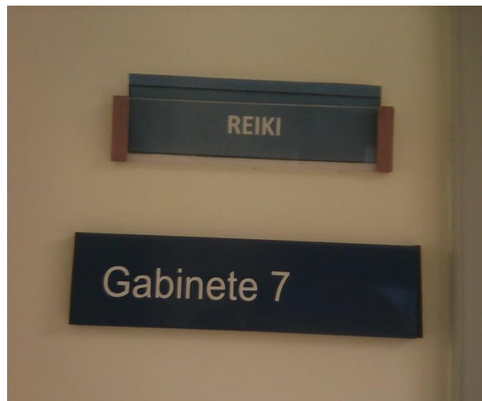
Information at the entrance of the offices